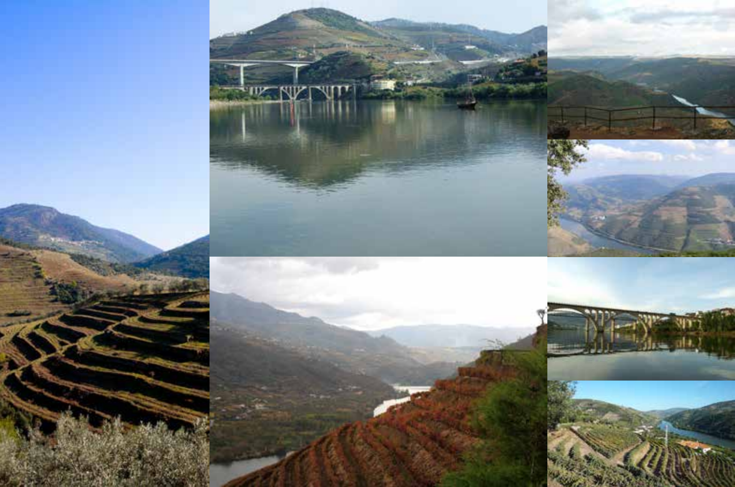
Douro Valley — UNESCO World Heritage

The natural resources are one of the region's greatest wealth. The hydraulic resources are particularly noteworthy; from the production of electric energy, the production of natural mineral and medicinal waters, thermal springs, to the resources of ornamental stones, the forestry resources and most of all, the winegrowing culture with a special emphasis on the production of Port wine.