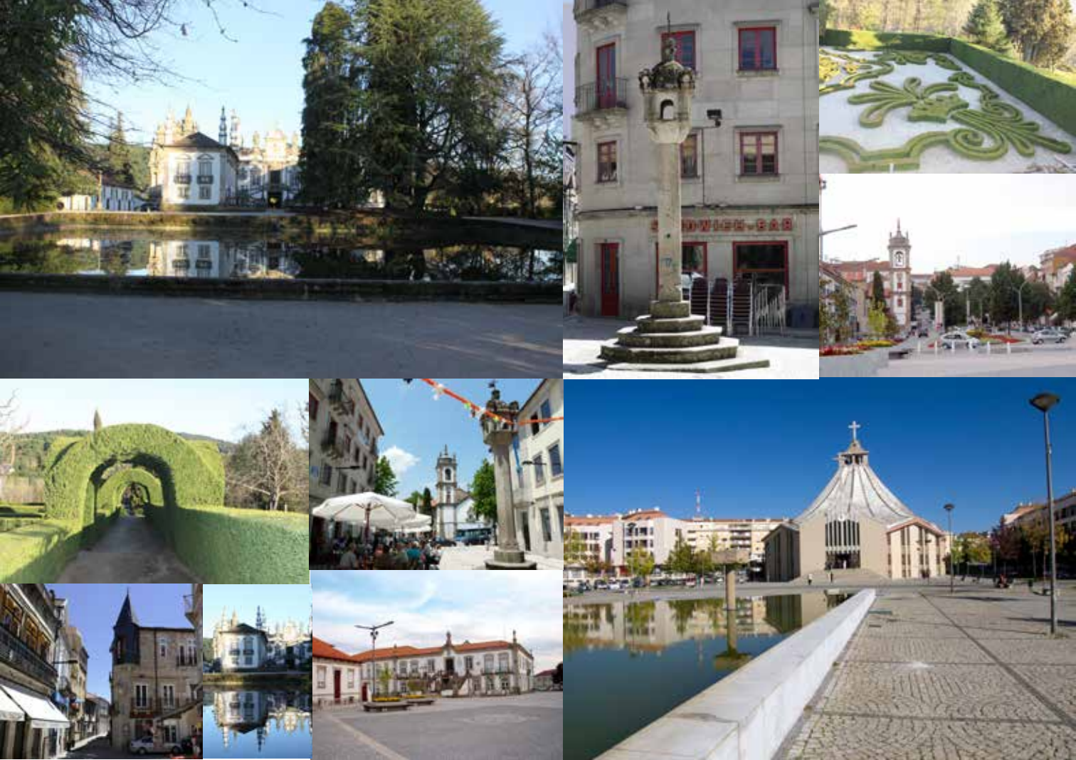
Vila Real town